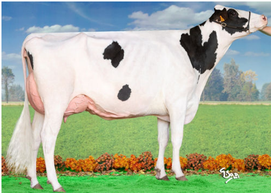
TOC-FARM 1ST GRADE FIORE GRANDDAM