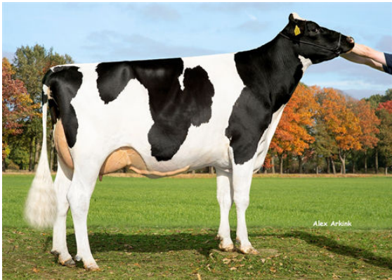
3STAR OH ROXANNE DAM