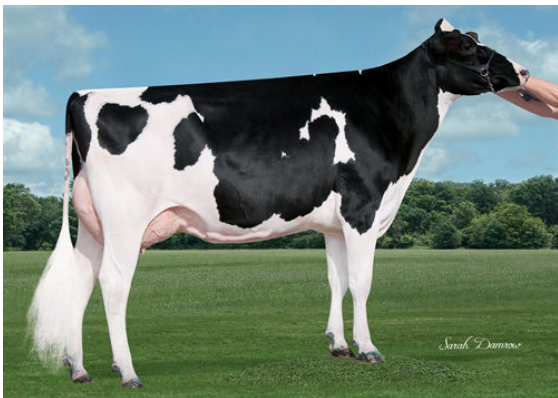
SIEMERS DOORMAN ROZ FOURTH DAM