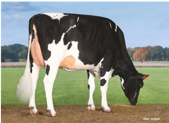
MISS MAGIC GRANDDAM