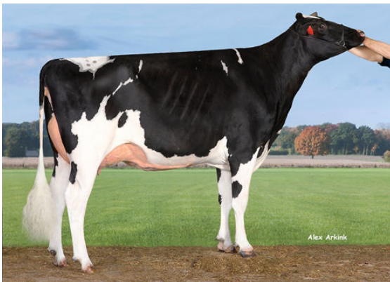
MISS MAGIC GRANDDAM