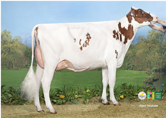
JB TOULLEC ASTRA RED DAM