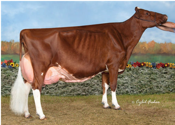
KHW REGIMENT APPLE-RED FOURTH DAM