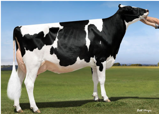
OUR-FAVORITE UNLIMITED FOURTH DAM