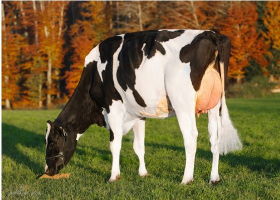
OUR-FAVOURITE SIDEKICK PAMELA DAM