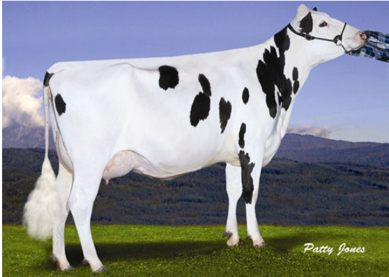
GILLETTE GARRETT LOOKAS FIFTH DAM