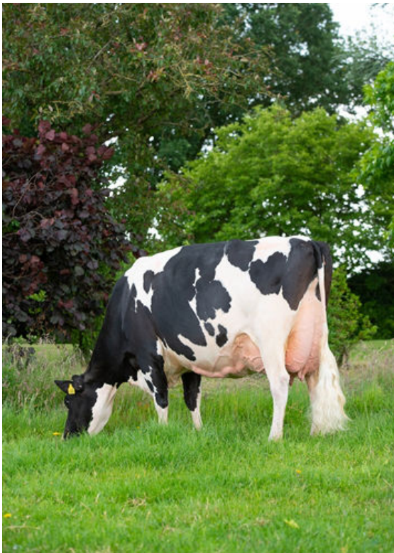
DE OOSTERHOF DG ROSE D DAM