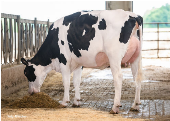
PROGENESIS RANGER ANTHEM DAUGHTER