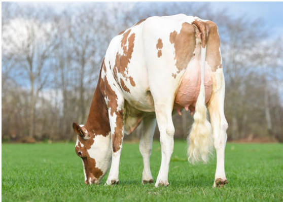
GIH LITTLE STAR DAUGHTER