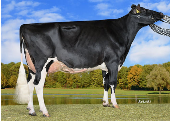
WILDER HERZ-P GRANDDAM