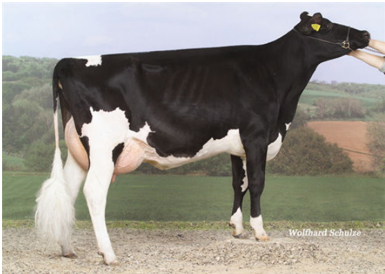
KONNY FIFTH DAM