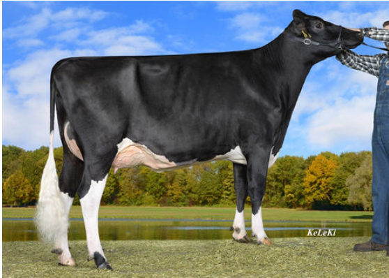
WILDER HERZDAME-P DAM