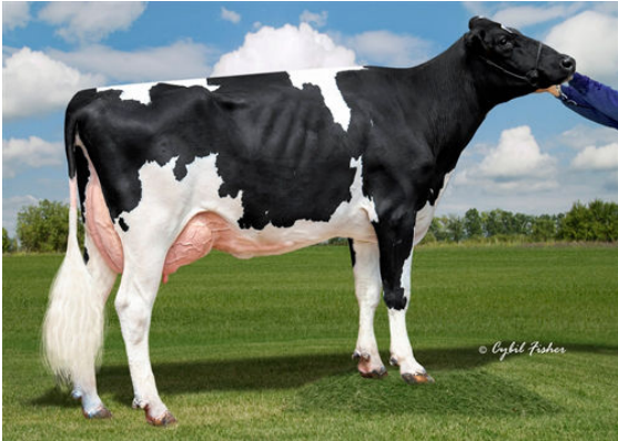
AOT MARK HIGHSTRUNG DAUGHTER