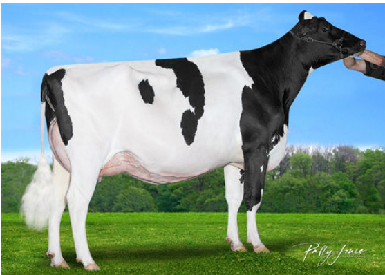
CLAYNOOK ZESTY MARK DAUGHTER