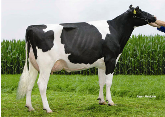
ZANDENBURG PLANET EBONY 3 DAM