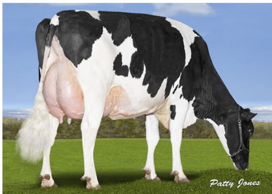
SNOWBIZ N UNO LENA