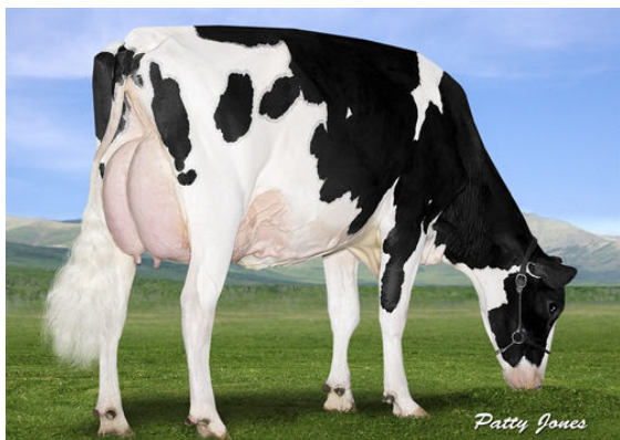
EDG RUBY UNO RIZA