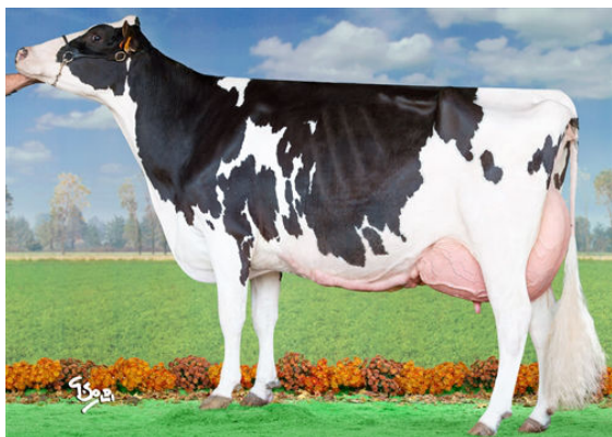
TOC-FARM UNO UDILIA