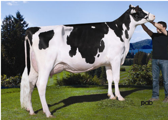
STE ODILE MANOMAN MOD PLATINE