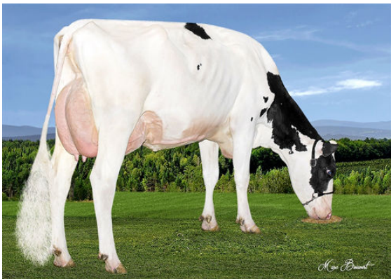
VAL-BISSON EXTREME SALVIA