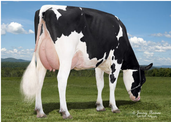
BRIGEEN PRESIDENT 2488