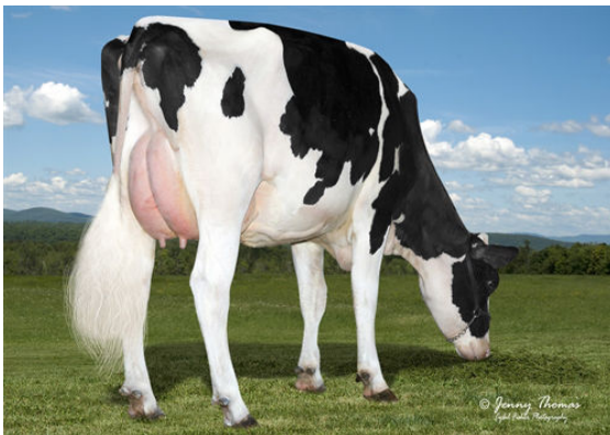
BRIGEEN PRESIDENT GIGGLE