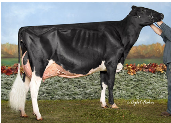
COMESTAR LAMADONA DOORMAN