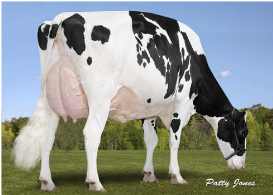
WALNUTLAWN DOORMAN BREANNA