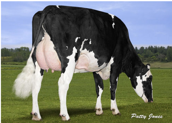
PARADIGM LAUSMART ELLEN