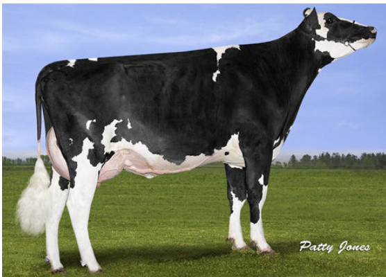
PARADIGM LAUSMART ELLEN