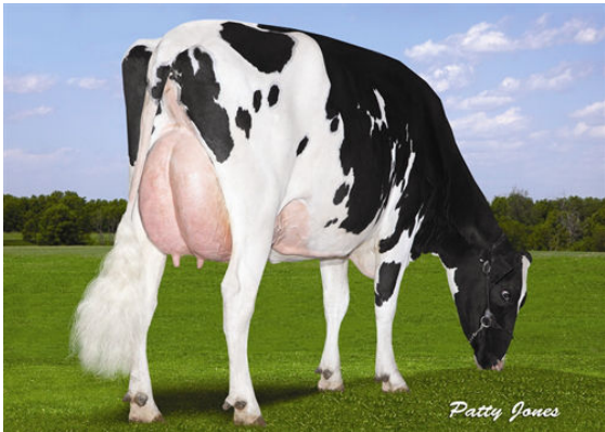
DON-MAIR CONTRAST ELLY