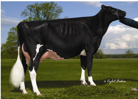
VAL-BISSON CONTRAST ILLARANTE

Left to Right Delaberge S L Contrast Solange; Val-Bisson Contrast Illimitee; Lamaria Lillipop Contrast; Val-Bisson Contrast Illeana