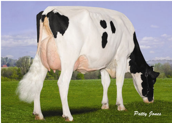
MISTY SPRINGS BIGSTONE SANDY