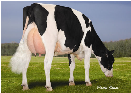
TRIKAMP BIGSTONE IVY