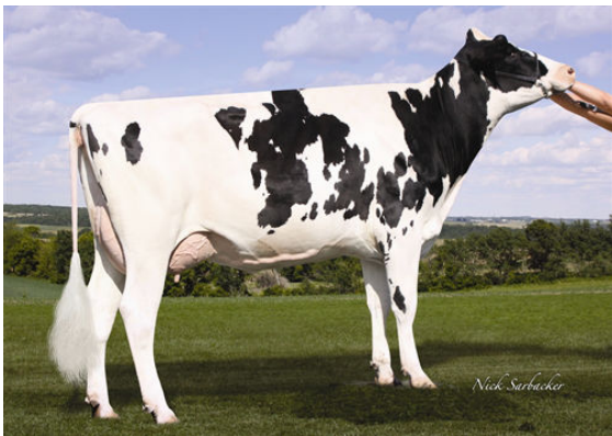
RINGA-LEA BIGSTONE 1224