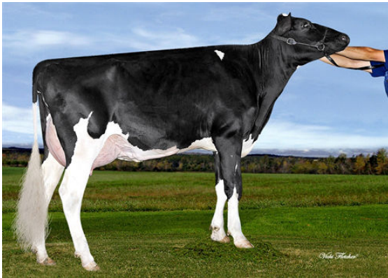
PROVETAZ OVERTIME CAMILA