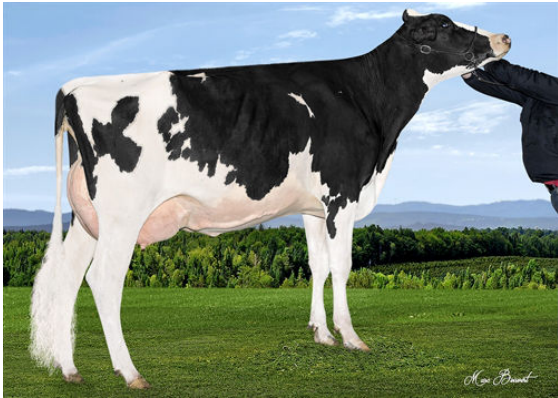
MICHERET EUJENNY BREKEM