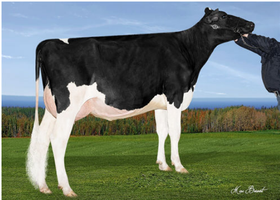
VIVEJOIE EMILI BREKEM