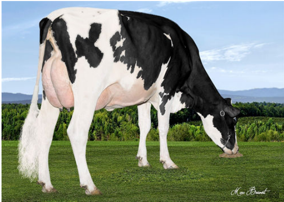
MICHERET EUJENNY BREKEM