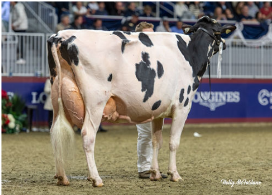
HUFFMANDEALE UNIX MAPLESUGAR DAUGHTER