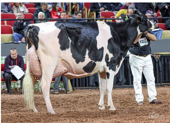
LADYROSE CAUGHT YOUR EYE DAUGHTER