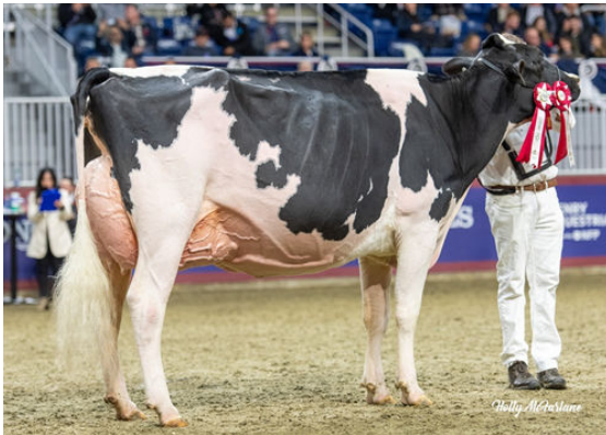
GLENIRVINE UNIX SALLY DAUGHTER