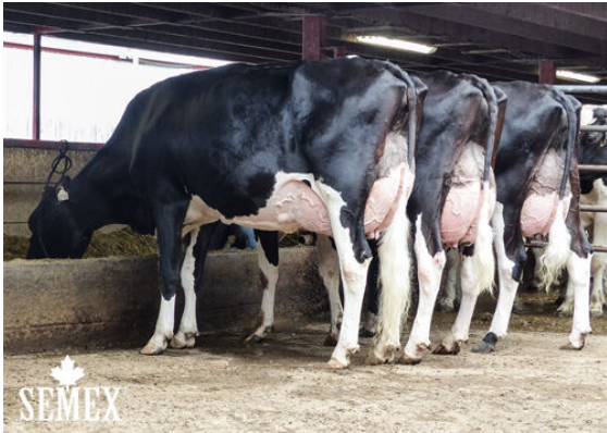
LAUTRUST DAUGHTER GROUP