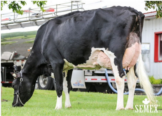
COMESTAR LAUHALI LAUTRUST