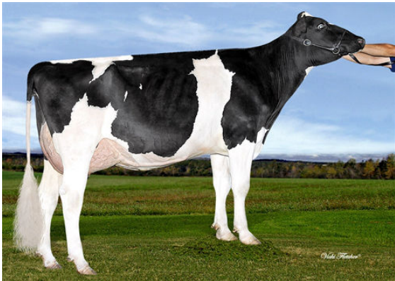
DUBONLAIT LAUTRUST GYPSY