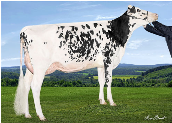
DESDEUXLACS BETUNIA AIRNTAKE