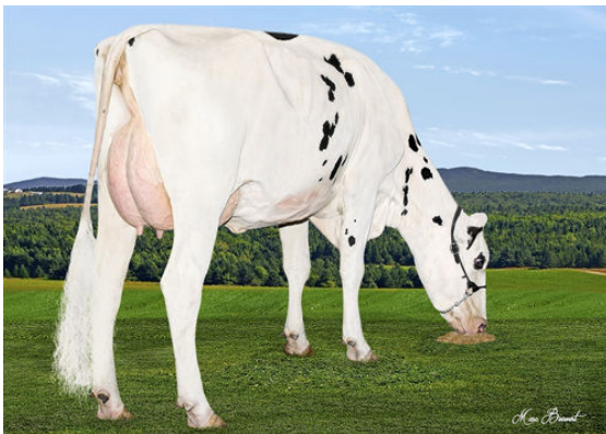
CHAMLAB RUMBA AIRINTAKE