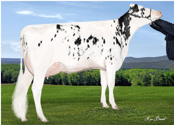
MASKITA AIRINTAKE TAMPOURA