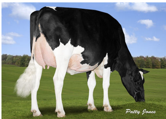
ORSERDALE CONTROL DELAWARE