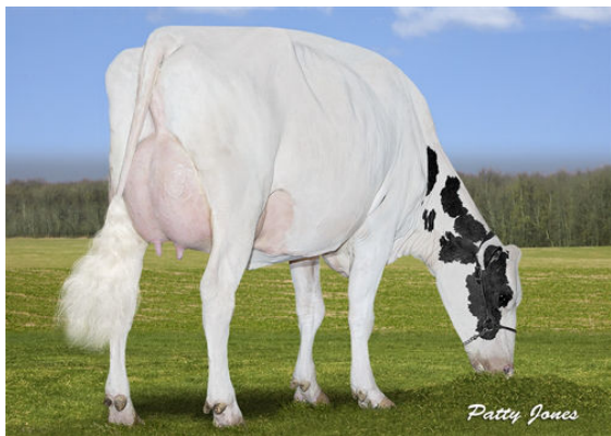
VELTHUIS B CONTROL LEGACY