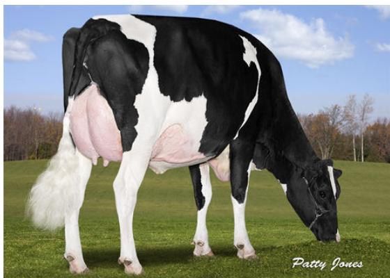
ALMERSON CONTROL CHAMPAGNE