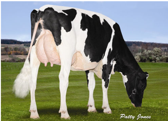
STANTONS LET IT SHINE