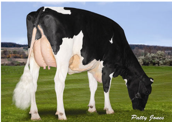
STANTONS LET IT BE