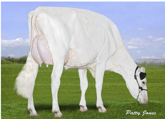
MISTY SPRINGS LIS BLANCHE