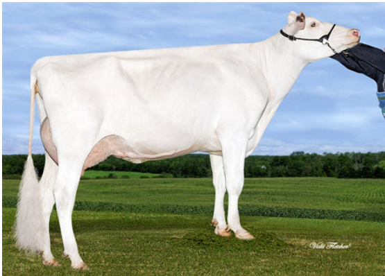
JOMAR ALPINE HOLLY