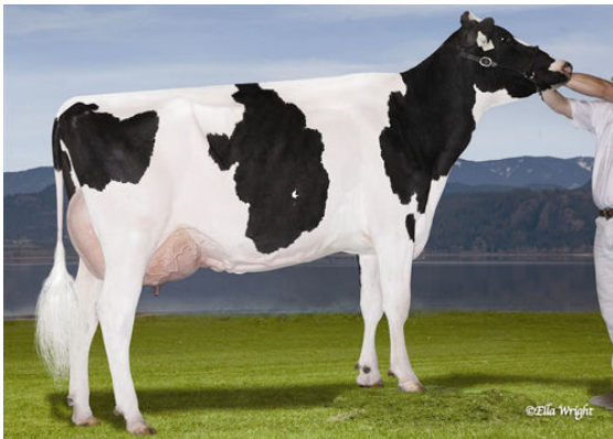
WABYBROOK STANLEYCUP MADELON