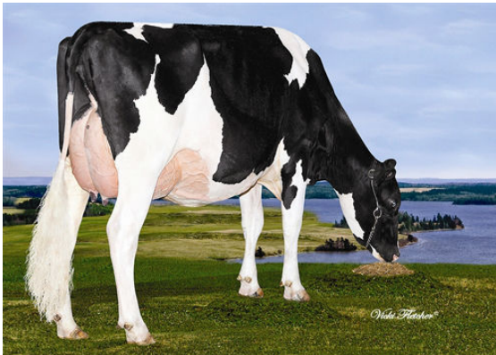
BARRVALLEY STANLEY CUP RETA