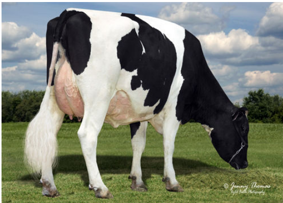
MCCOL CELTIC 10003