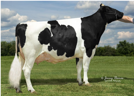
MCCOL CELTIC 10003