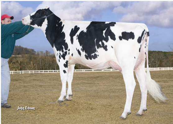
WABASH-WAY BOL ELIZABETH Dam