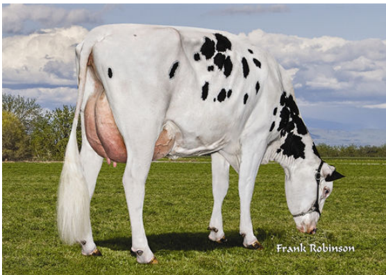
AIR-OSA MASTERPIECE 16729