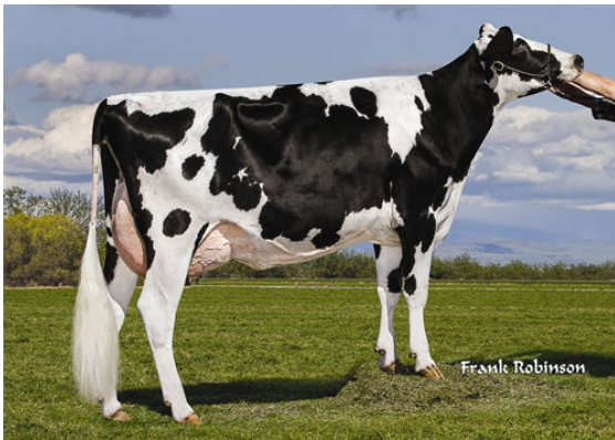
COSTA-VIEW MASTERPIECE 49311