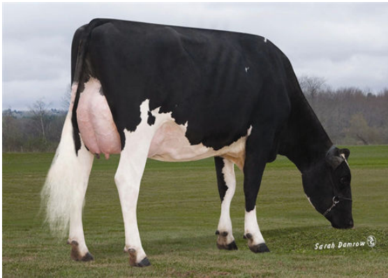
REDCARPET MASTERPIECE ARMS