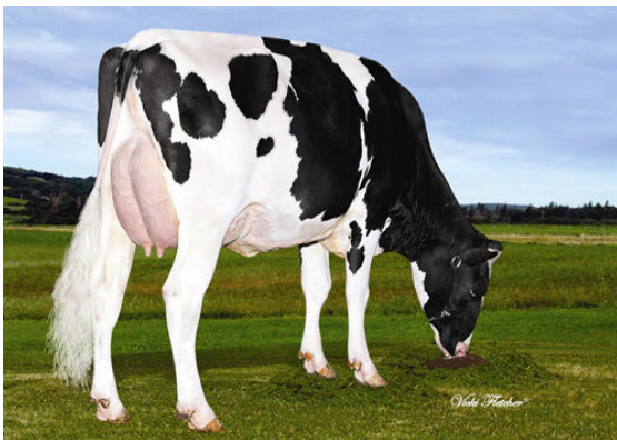
DEUX RIVIERES DENSITY MOLLY