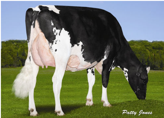
PETHERTON DENSITY RATZ