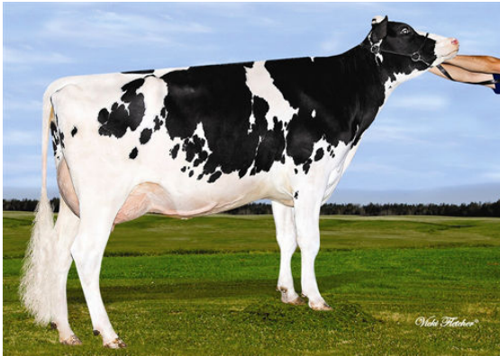
LAMPARDIS MEDIUM DENSITY