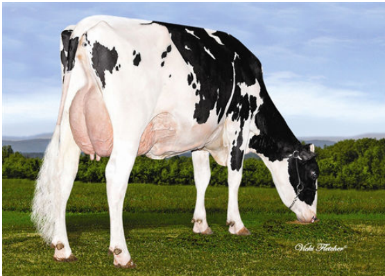
VALLEYCLAN JETER PATSY