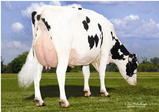
HILLTOP-LLC JETT AIR 4459