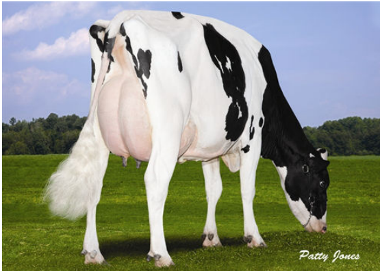
TWOMEIER JETT AIR 1956