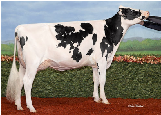
MILLBROOKE JETT AIR DIVA