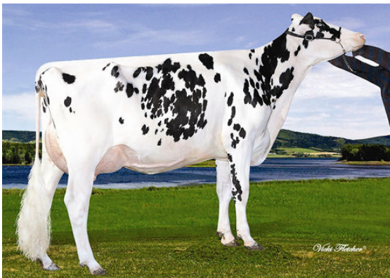
LINDENRIGHT MANIFOLD DELIGHTED