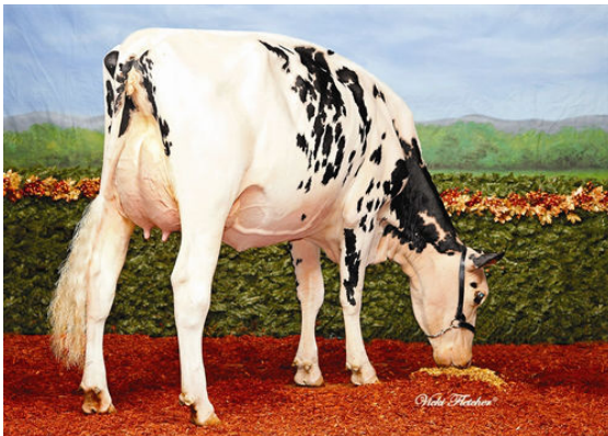
MARYCLERC C MANIFOLD DELLIMA