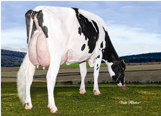
LINDENRIGHT MANIFOLD DIME