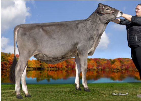
JOLLY ELISIUM MAZIE DAUGHTER