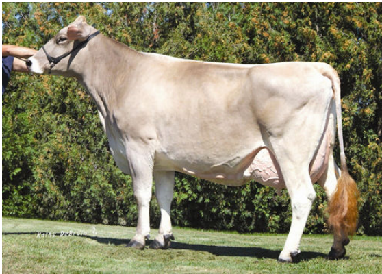
HILLTOP ACRES JOLT DOLL FIFTH DAM