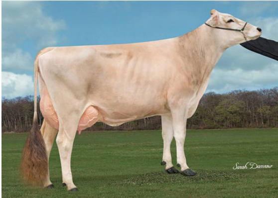
HILLTOP ACRES CAD PAULA GRANDDAM