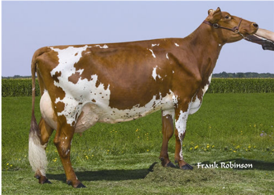
LA SAPINIÈRE FACY-B THIRD DAM