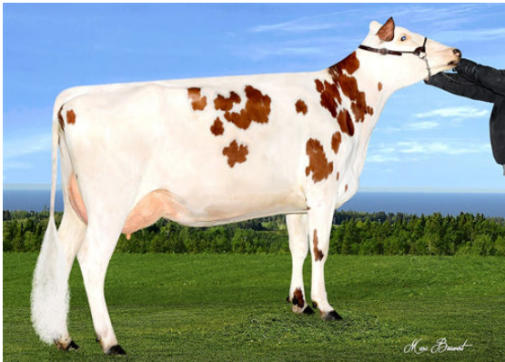
GUIMOND REVOLUTION DOMINANTE