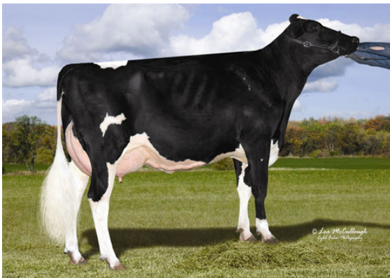
COOKIECUTTER MOM HALO FOURTH DAM