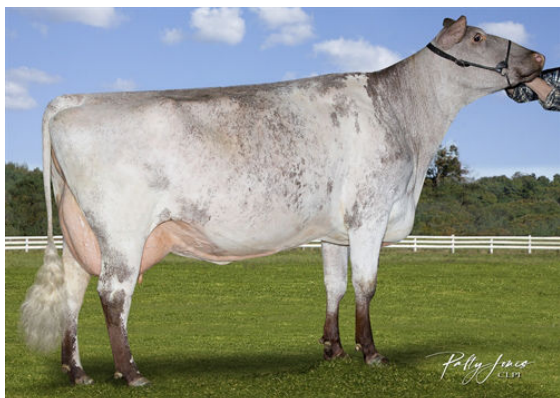
EMADALE LSC TACO MAID DAUGHTER