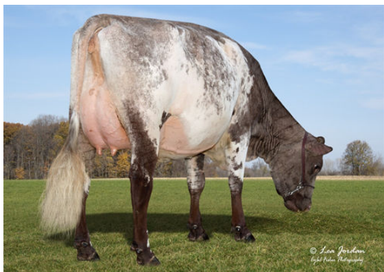
PINE-VALLEY ST CLARE FANTASY