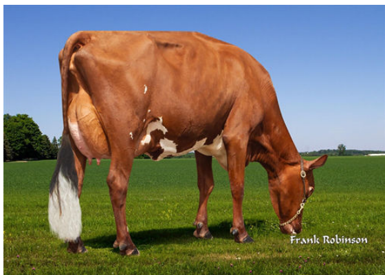
PINERILLE ST CLARE HICCUP