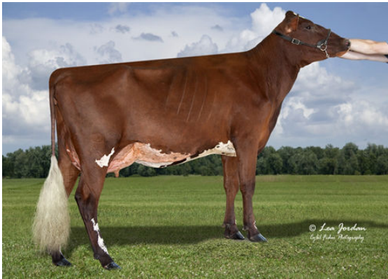
HOT MESS CONRAD BIRDIE