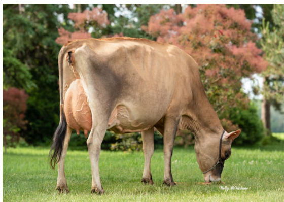
PAULLOR VIRAL MAVORNA

HAWARDEN IMPULS PREMIER ARETHUSA ON TIME VOGUE EX-94-5YR-CAN 3* LENCREST ON TIME HURONIA CENTURION VERONICA 20J EX-97%-5E-USA SOONER CENTURION GENESIS RENAISSANCE VIVIANNE VG-87-2YR-CAN 7*