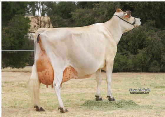
BUSHLEA BROOK MAYBELL