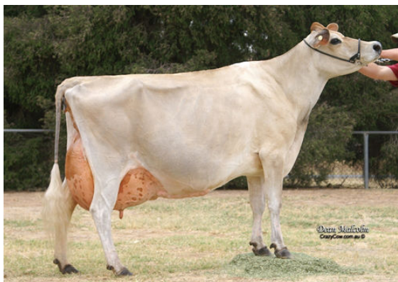
BUSHLEA BROOK MAYBELL