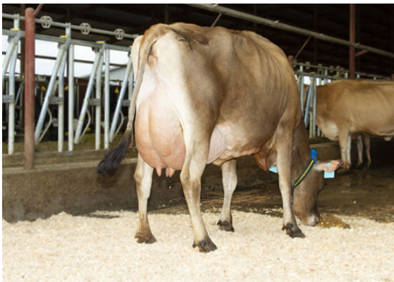
RACHELLES VICEROY LOUISE THIRD DAM