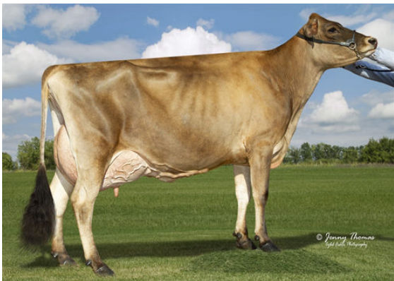
RACHELLES VICEROY LOUISE THIRD DAM