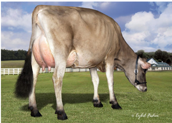
JER-Z-BOYZ MACNCHEZ 48947 THIRD DAM