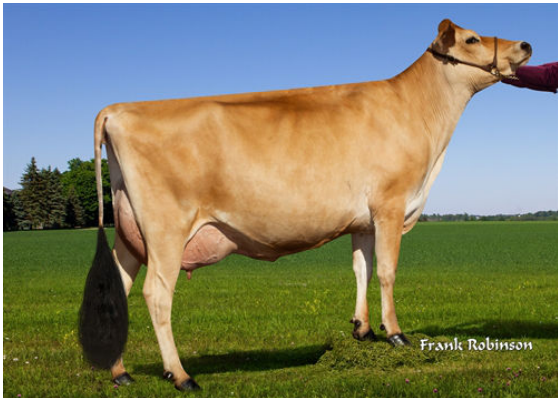
PROGENESIS MADISON- DAM

RIVER VALLEY HERITAGE {6} PROGENESIS MADISON EX-90%-3YR-USA JX RIVER VALLEY CHIEF {6} RACHELLES VICEROY LOUISE VG-88%-6YR-USA CDF VICEROY RACHELLES GENOMINATOR 7857