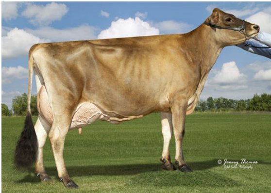
RACHELLES VICEROY LOUISE GRANDDAM