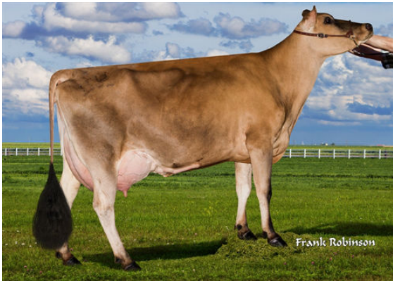
JX FARIA BROTHERS HULK YAYA TOURE {2}