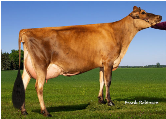
JX VIERRA GYSPY {4}