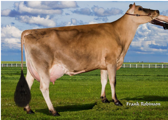
JX FARIA BROTHERS HULK YAYA TOURE {2} THIRD DAM